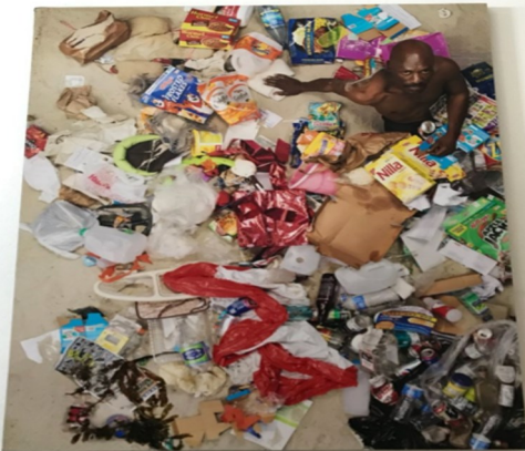
Image from the photographic exhibition of the Californian photographer Gregg